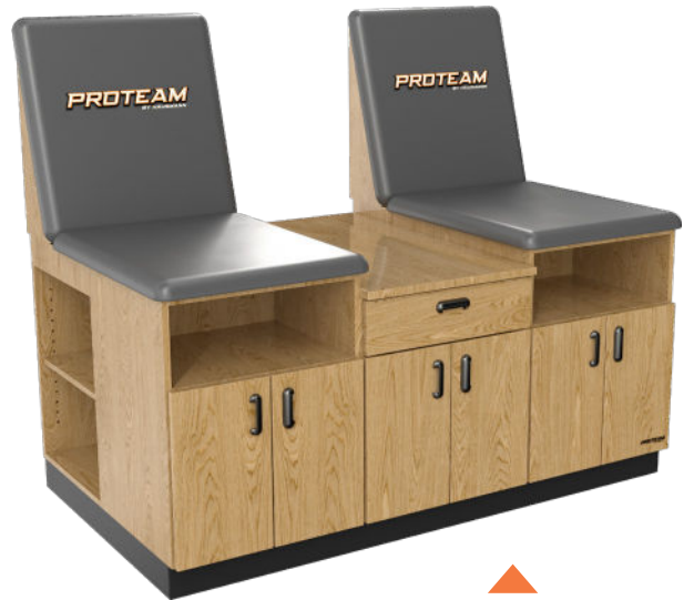
Modular Taping Station