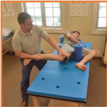
Iliotibial Band (ITB) Stretch