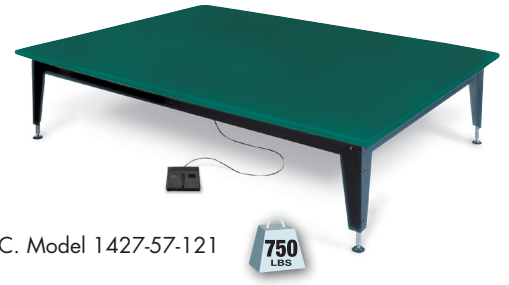
750 LBS C. Model 1427-57-121