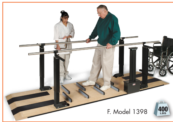
400 LBS F. Model 1398