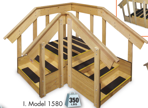
350 LBS I. Model 1580