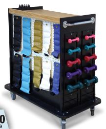
Z. Model 5556 Mobile Therapy Station Grab bar and 4" locking casters. Model 5556-100 Mobile Therapy Station plus accessories.