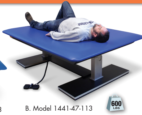
600 LBS B. Model 1441-47-113