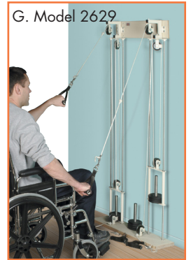
G. Model 2629