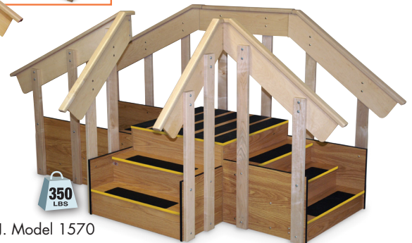
350 LBS J. Model 1570