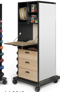
U. Model 1671

R. Model 5560 Econo Weight Rack Storage for weights, full-view mirror. Model 5560-100 Weight Rack plus accessories.