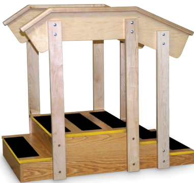
350 LBS H. Model 1566