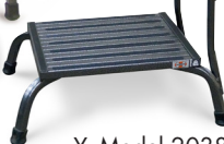
Y. Model 2038

W. Model 2153 Economy Air-Lift Stool Single lever height control.