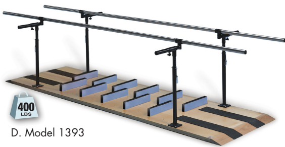
400 LBS D. Model 1393