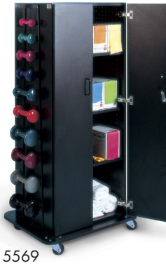
S. Model 5569