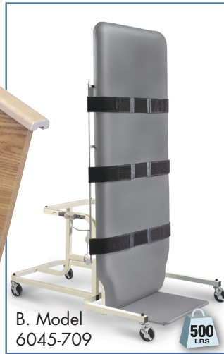
B. Model 6045-709