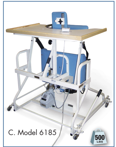
C. Model 6185