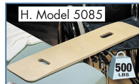
H. Model 5085